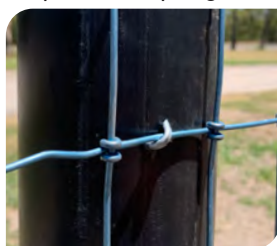
Tek Screws & clips